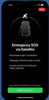
iPhone 14 ( North America Only )