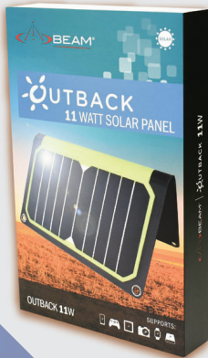
BEAM OUTBACK 11 WATT SOLAR PANEL